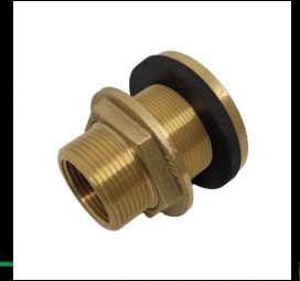
25mm Brass Tank Fitting