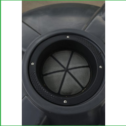
200mm Leaf Sieve