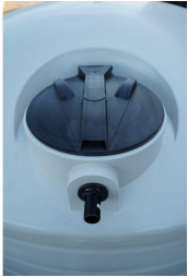
455mm Screw Access Lid