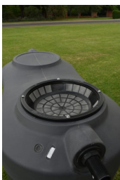
400mm Leaf Sieve