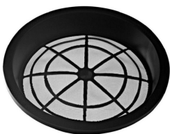
400mm Leaf Sieve