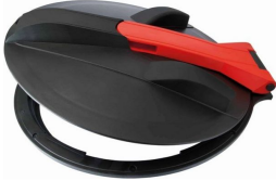
455mm Screw Access Lid