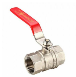
25mm Ball Valve Tap