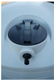
455mm Screw Access Lid