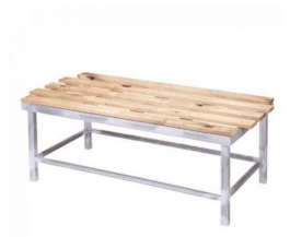
600Ltr Slimline Tank Stand