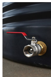
25mm Ball Valve Tap