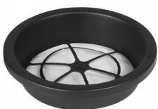
300mm Leaf Sieve