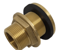
25mm Brass Tank Fitting